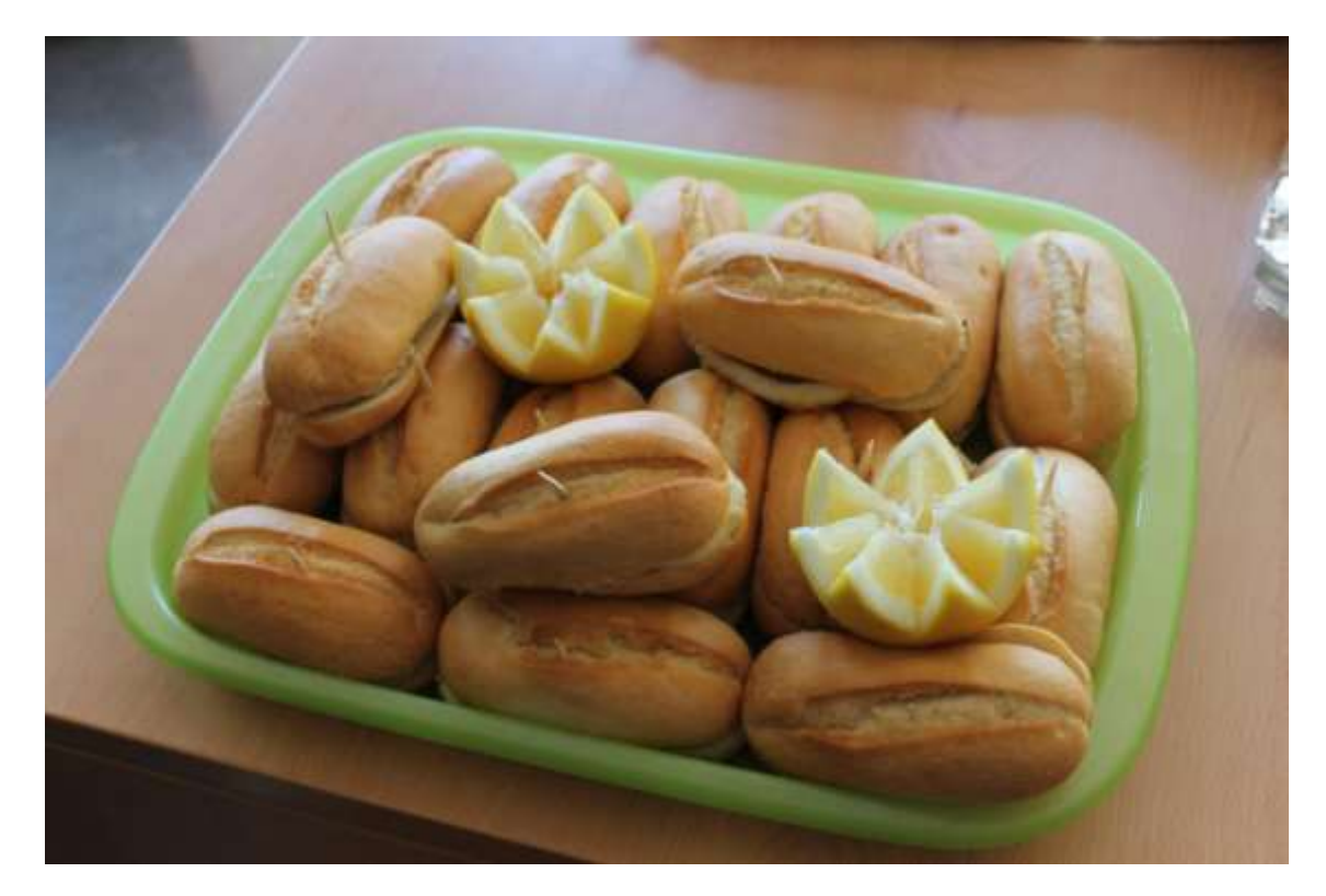
Lucia cooked some squid sandwiches for us. We were starving that day so we gobbled them down. Delicious!