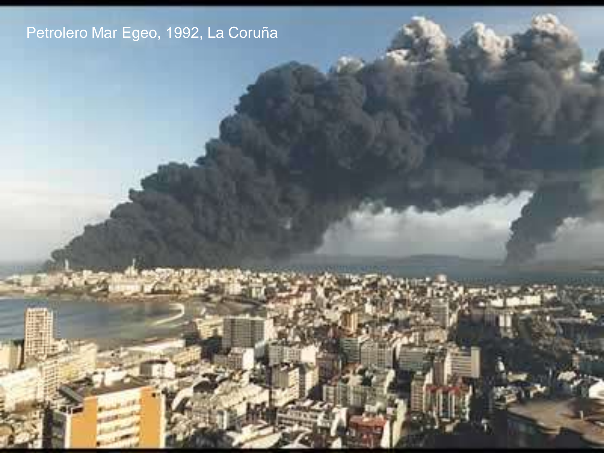
Petrolero Mar Egeo, 1992, La Coruña