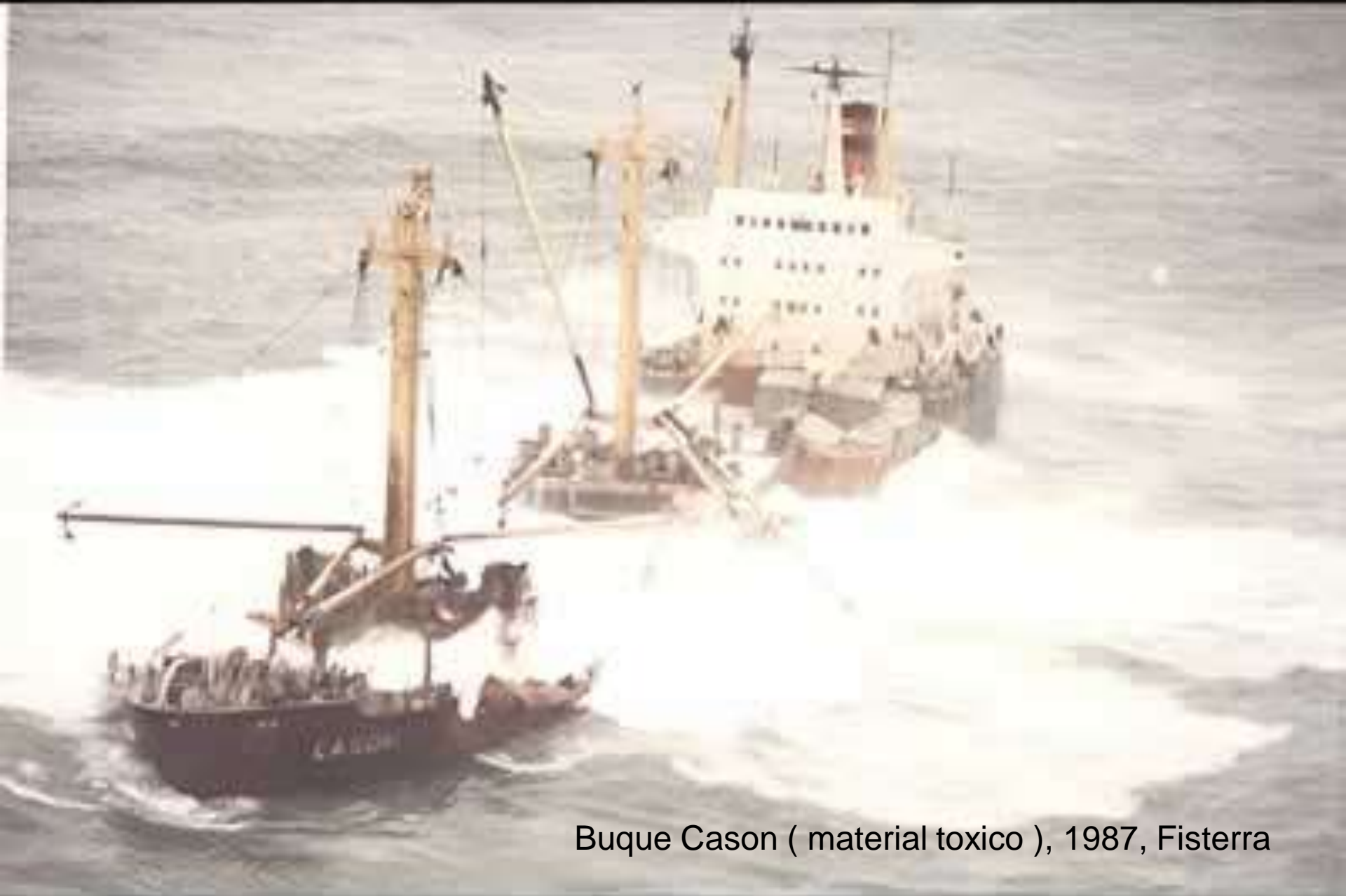
Buque Cason ( material toxico ), 1987, Fisterra