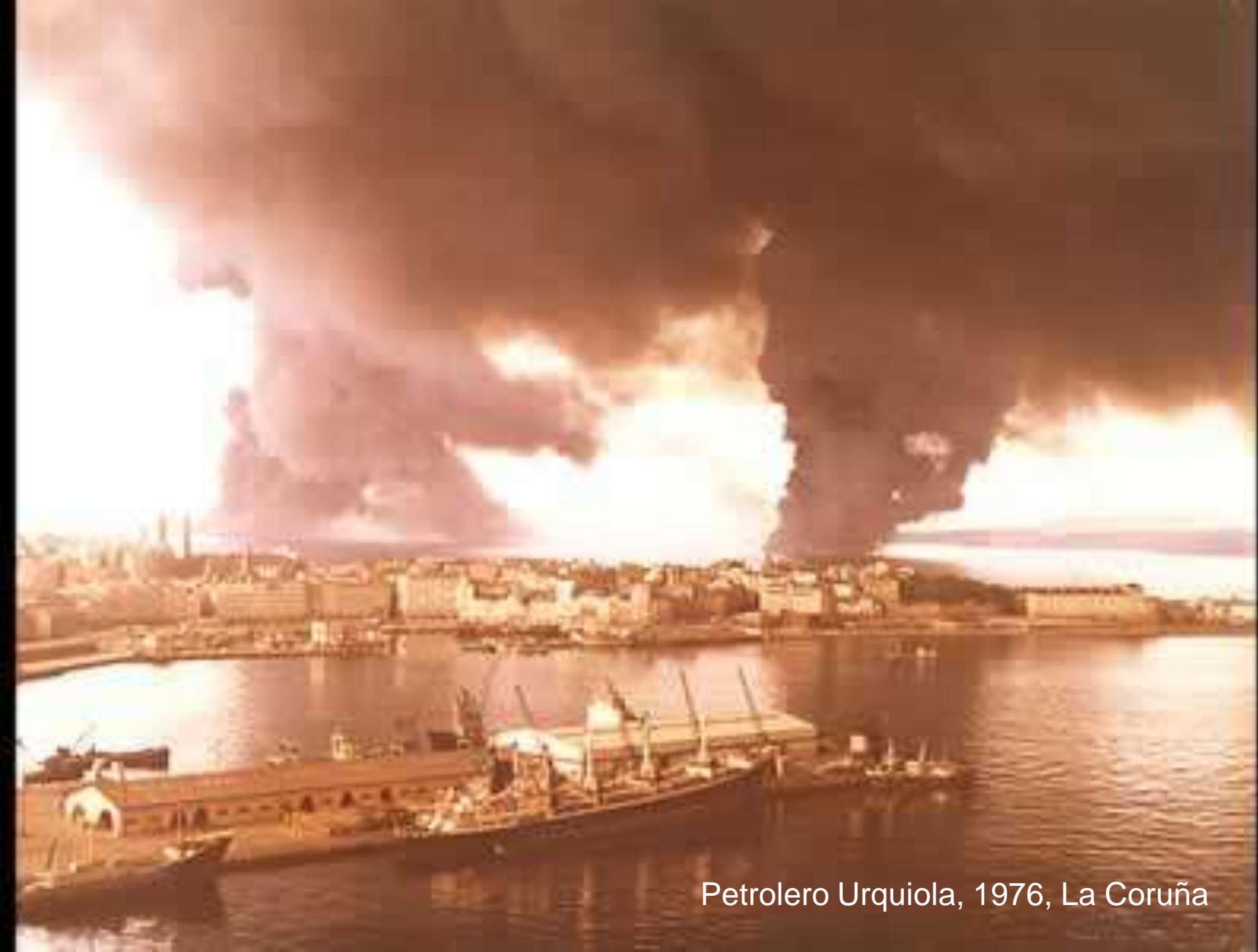
Petrolero Urquiola, 1976, La Coruña